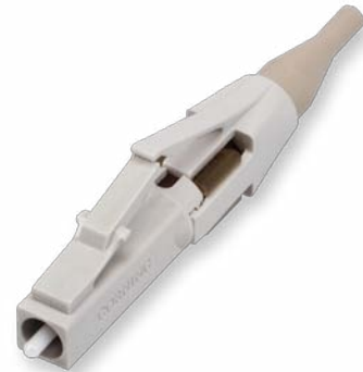
Part Number: 95-000-99

Corning Cable Systems UniCam® High-Performance Connectors offer best-in-class optical performance in a fast, easy field-termination solution. These high-precision connectors guarantee exceptional insert loss – 0.1 dB typical/0.5 dB maximum per connector pair for multi-mode, 0.2 dB typical/0.5 dB maximum per connector pair for single-mode. Installation of an LC, SC, or ST® Compatible Connector can be accomplished in about 45 seconds with the UniCam High-Performance Tool Kit. The lightweight, handheld installation tool and the high-performance cleaver virtually eliminate human variability from installation, ensuring terminations are right, the first time, every time. This kit was designed with consideration for the network installers, from the cleaver, with its integrated fiber scrap bin and dual-clamp precision hold, to the installation tool, with its immediate go/no-go feedback signal. Installation is as easy as strip, clean, cleave, cam and crimp, with exceptional optical performance guaranteed. Every UniCam Connector is guaranteed to meet the published specification at the time of installation or Corning Cable Systems will replace it.