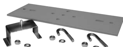
Note: 12730 Kit shown