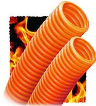
Plenum rated Innerduct

In the past, indoor fiber optic cable was often installed in innerduct. Innerduct is essentially a plastic tube with a pull string inside it. This tube offered an additional layer of protection for the fiber optic cables inside it, as well as helped identify it in the building. However, using innerduct added cost. In addition to the cost, which in the case of plenum rated innerduct is significant, you had to install it and then pull the fiber optic cable through it. Innerduct also provided an easy pathway for other cables that were going in the same direction. This is not desirable since the contractor who is appropriating the pathway may not be overly concerned with damaging the fiber currently in it. JIA I/O does not permit the intrusion of other cables.