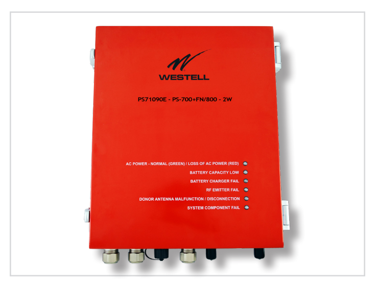
PS71090E Public Safety BDA shown